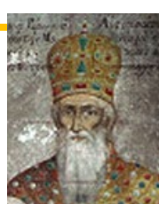
Andronicus II Palaeologus