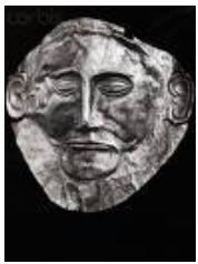
1500 BC Mycenaean Mask