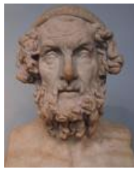
750 BC Homer