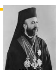
1960 AD Makarios